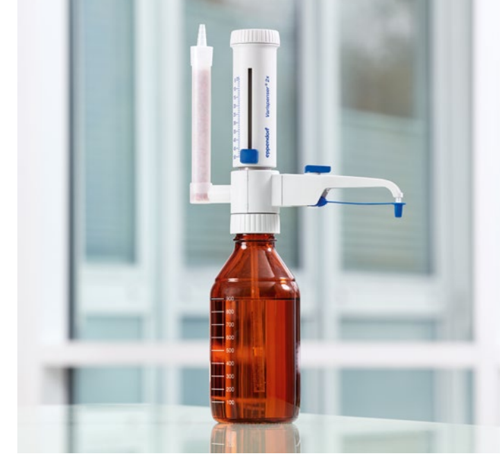
E.g. fuming acids often used in chemical industry need to be kept free from moisture. The drying tube – filled with moisture absorber protects the liquid.