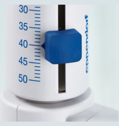
New! Ergonomically designed slide for smooth volume adjustment and fixation