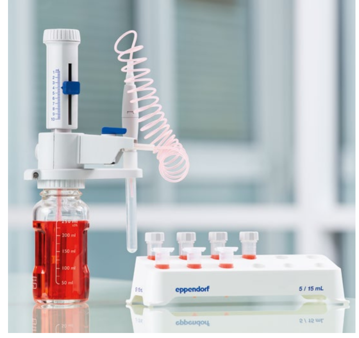
The flexible discharge tube gives you safe and direct access to your small and narrow test tubes and allows for fast and precise serial dispensing.